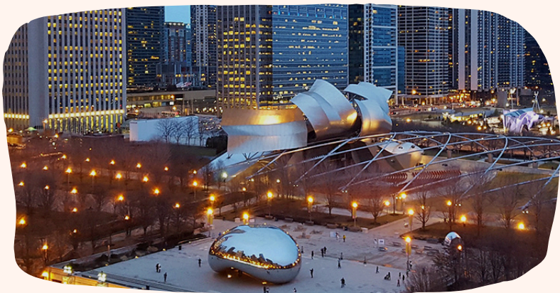
MILLENNIUM PARK Home of Cloud Gate