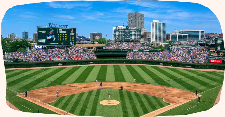
WRIGLEY FIELD Home of the Cubs