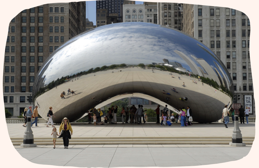
CLOUD GATE "The Bean"